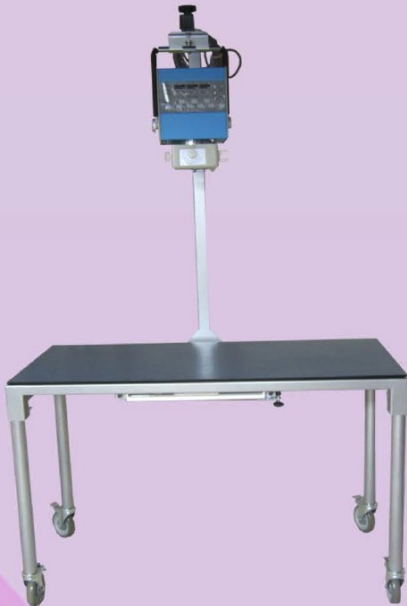
Portable X-ray Table

JPI Healthcare Solutions Inc. 52 Newtown Plaza Plainview NY 11803 Toll Free: 888-574-2001 Tel: 516-513-1330 Fax: 516-513-1331 www.jphealthcare.com