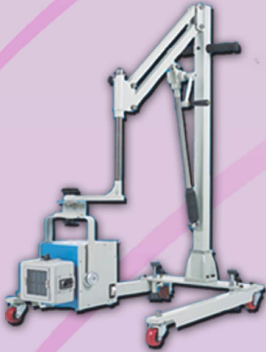
J-Stand - For indoor use only